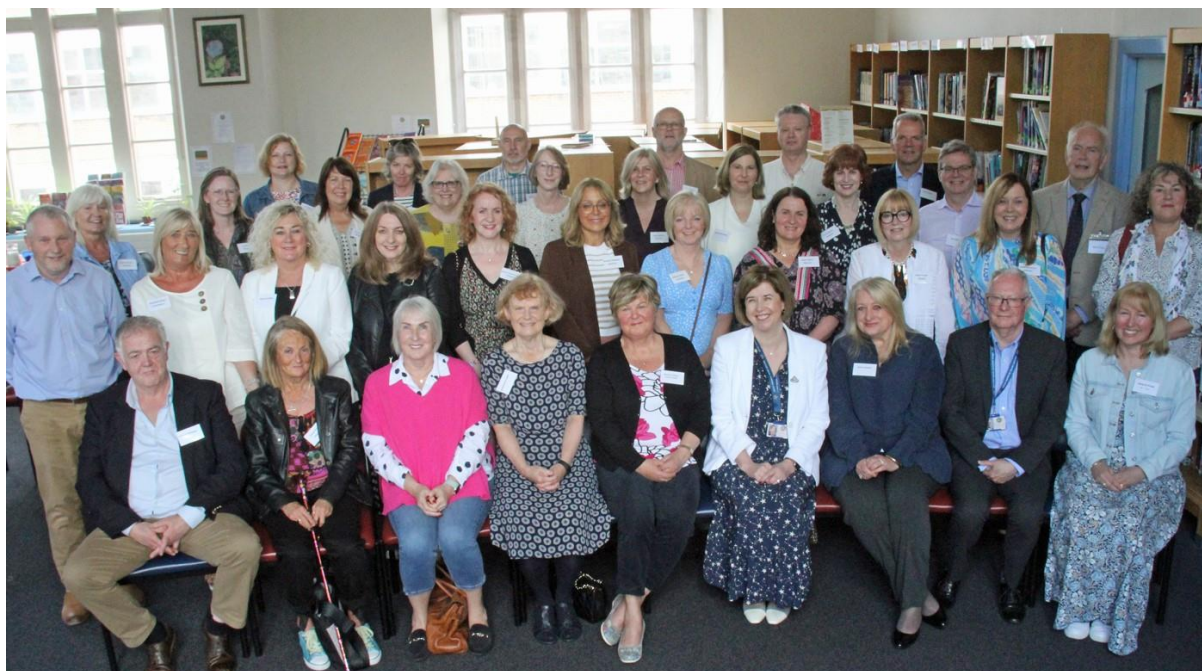
BRA Class of 1983 - 40 Year Reunion Lunch in the BRA Library - 26/May/2023