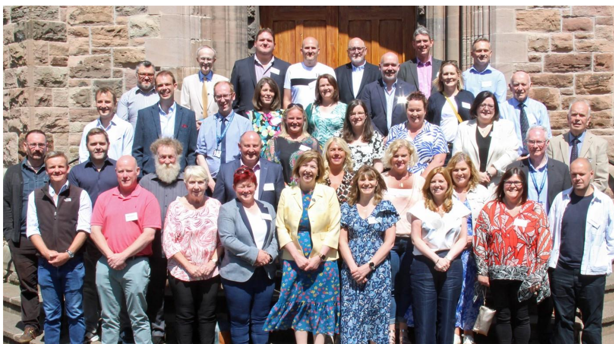
BRA Class of 1993 - 30 Year Reunion Lunch in the BRA Library - 9/Jun/2023