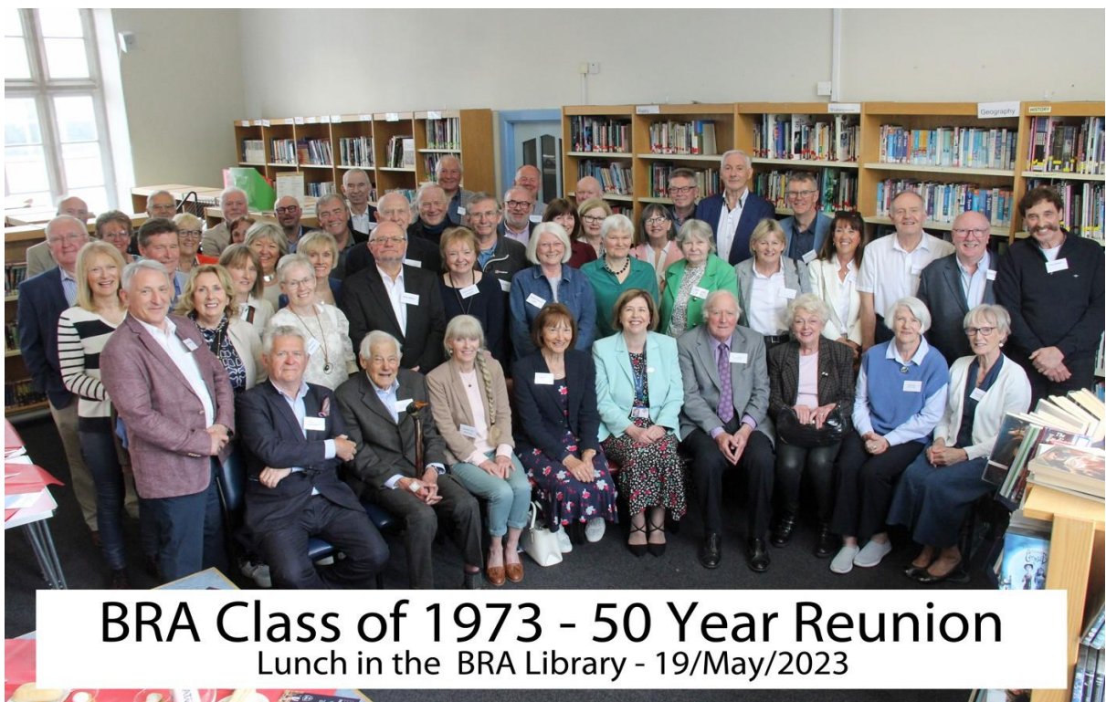
BRA Class of 1973 - 50 Year Reunion Lunch in the BRA Library - 19/May/2023

In the Summer Term we were delighted to host a series of four alumni reunions for the milestone anniversaries of the 50, 40, 30 and 20 year groups. Over the course of the four events we were joined by over 200 former pupils who all enjoyed a celebratory lunch and tour of the school. The buzz of old acquaintances renewed felt very special and even some former teachers made guest appearances and joined in the celebrations. We were thrilled that so many people made the effort to attend these events, many of whom had travelled from afar, and we look forward to hosting a similar series of reunions next year for the classes of 1974, 1984, 1994 and 2004. Further information and dates will be confirmed in due course.